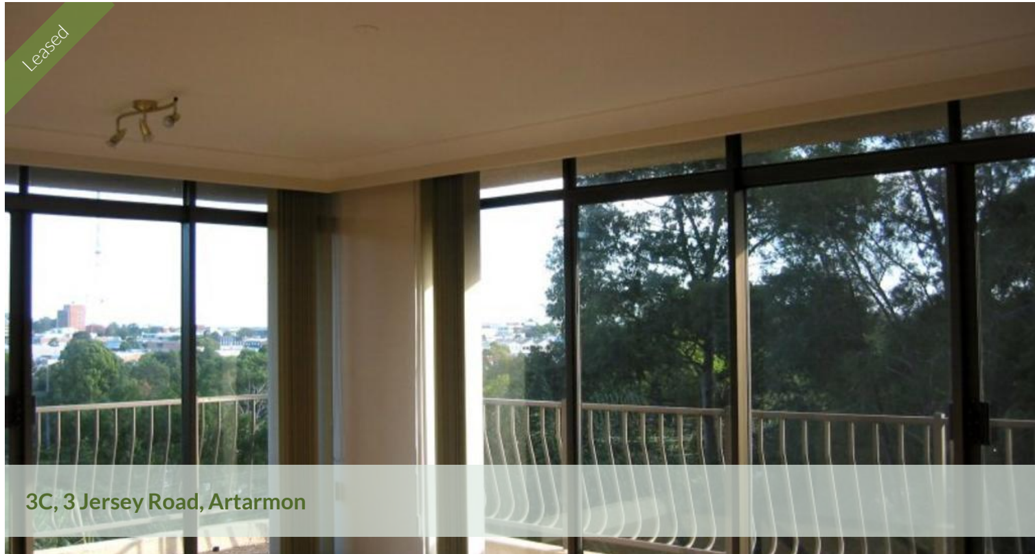
3C, 3 Jersey Road, Artarmon