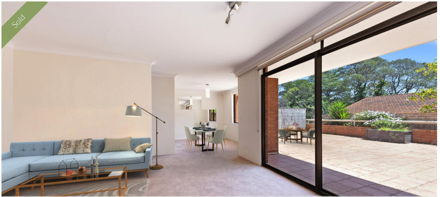
Unit 22, 11-19 View St, Chatswood